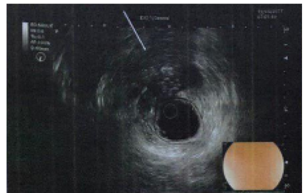
Figure 1. Endoscopic ultrasound that revealed a large heterogeneous mass lesion

Mature teratoma is a three-layered germ cell tumor commonly found in the ovary, testes, or mediastinum (3). Due to the lack of germ cells in the gastrointestinal tract, teratoma occurs less commonly in the digestive tract (4). It is believed that primary rectal teratoma only occurs when germ cell aberrantly enters the digestive tract. Primary rectal teratomas are scarce, and only a few cases have been described in the literature (5). Only 54 cases were reported in the world, and four cases have been published in Korea (6, 7). Rectal teratoma is more common in women, with only one case reported in men. Teratoma is highly suspected when there is hair on the